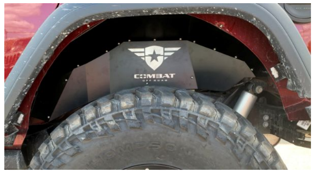
Driver Side Completed