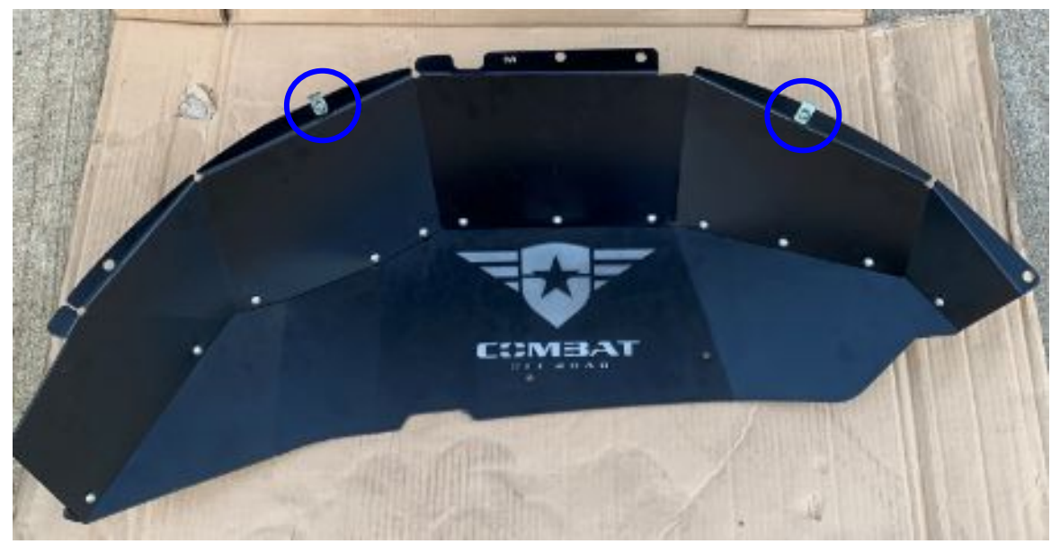
Driver Side Assembly