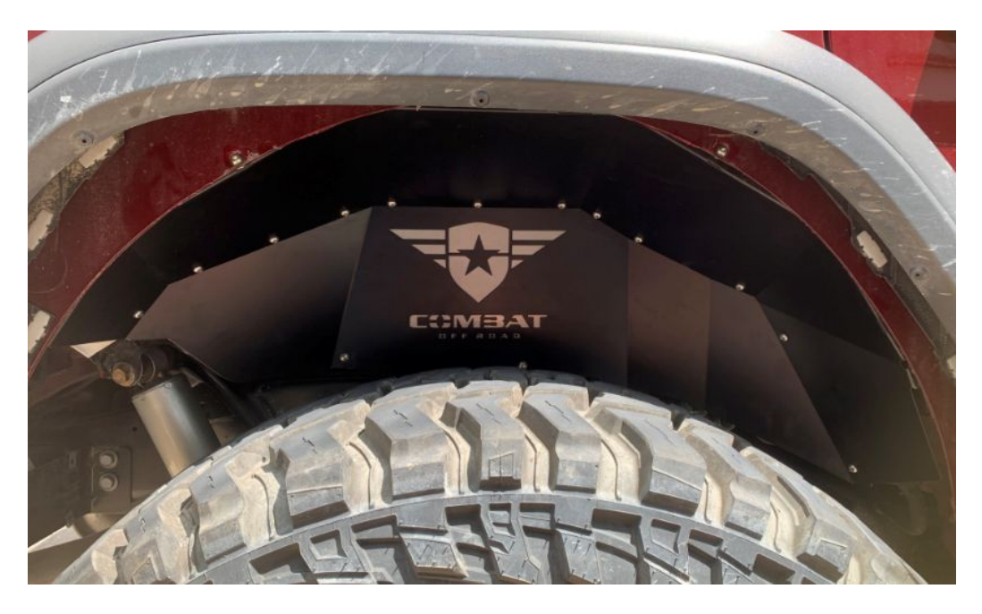
Passenger Side Completed

Use the supplied bolts and washers at the 2 upper and 2 lower mounting locations where the speed clips were installed in the previous steps. Tighten with the 4 mm Allen key.