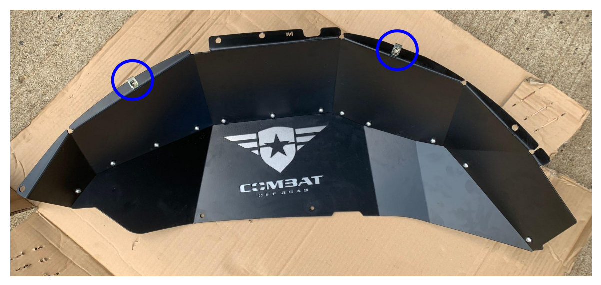
Passenger Side Assembly

Install speed clips as shown in the circled locations, these will be used to secure to the vehicle body later during the installation.